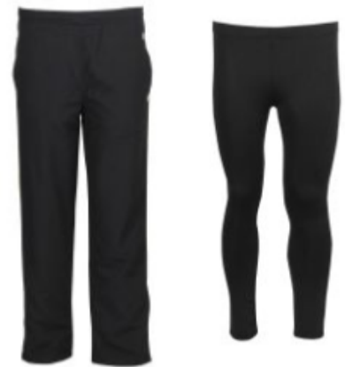
Plain black jogging bottoms or leggings. In the warmer months this can be swapped to plain black shorts.

Trainers can be any colour but must be suitable for sport.