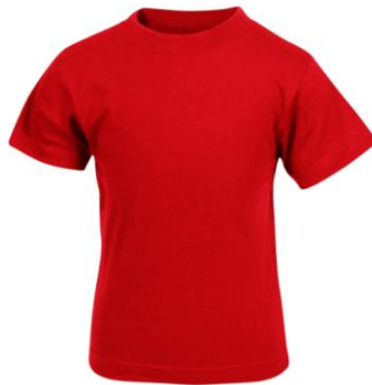
Plain red t-shirt.

If not a school-supplied hoody, please make sure the top is plain. No logos please.