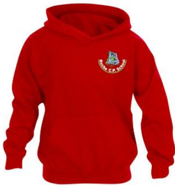
Red hoody, cardigan or sweatshirt.

From September we are continuing with our PE kit style uniform.