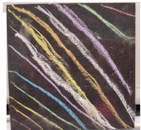
Amazing stripes Raeven! This art work is fantastic! Well done!