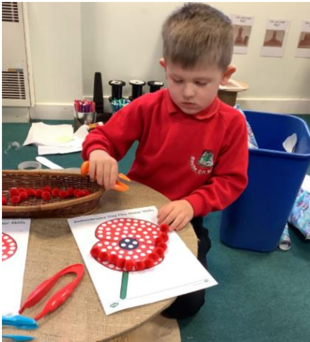
Wow Oscar! We love your poppy picture!