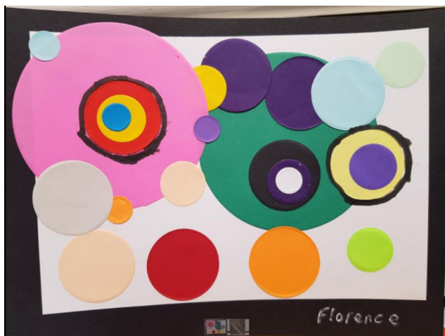
Well done Florence on your wonderful circular art work! What beautiful colours!