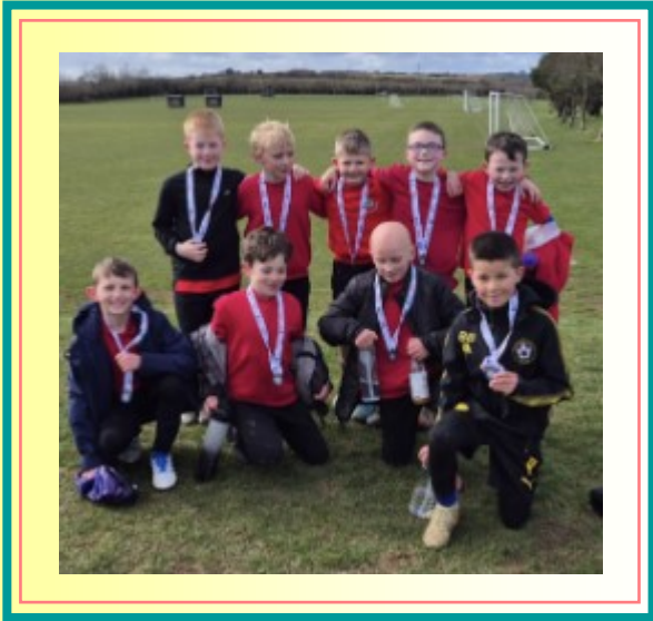
Photo of the Year 3 and 4 boys with their medals they won last week at Nanphysick. Well done boys!